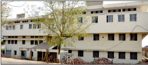
Department of Computer Engineering