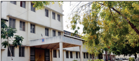
Department of Mechanical Engineering